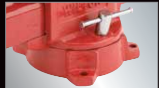
4 MOUNTING POSTS